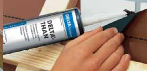
Easy-to-use with DELTA®System components.