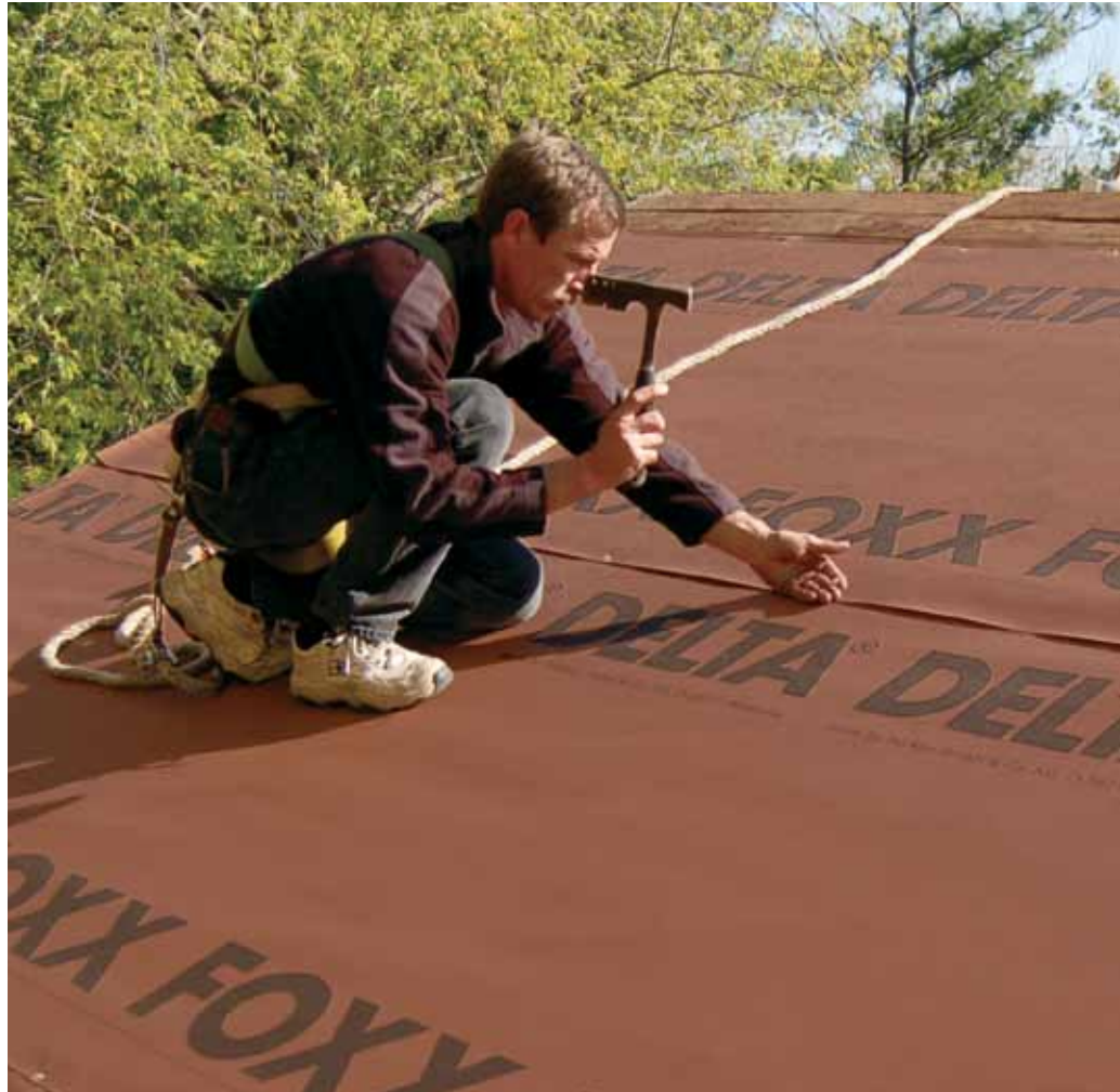
Fast and easy installation with DELTA®-FOXX.

Evaluation Report (Certification) ICC-ESR2625