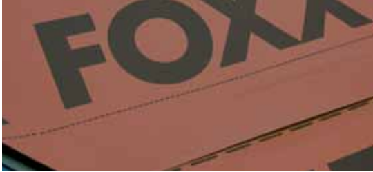
Windproof when used with DELTA®-THAN.