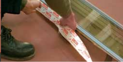
Suited for use as rainproof roof lining, DELTA®-FOXX is absolutely waterproof.